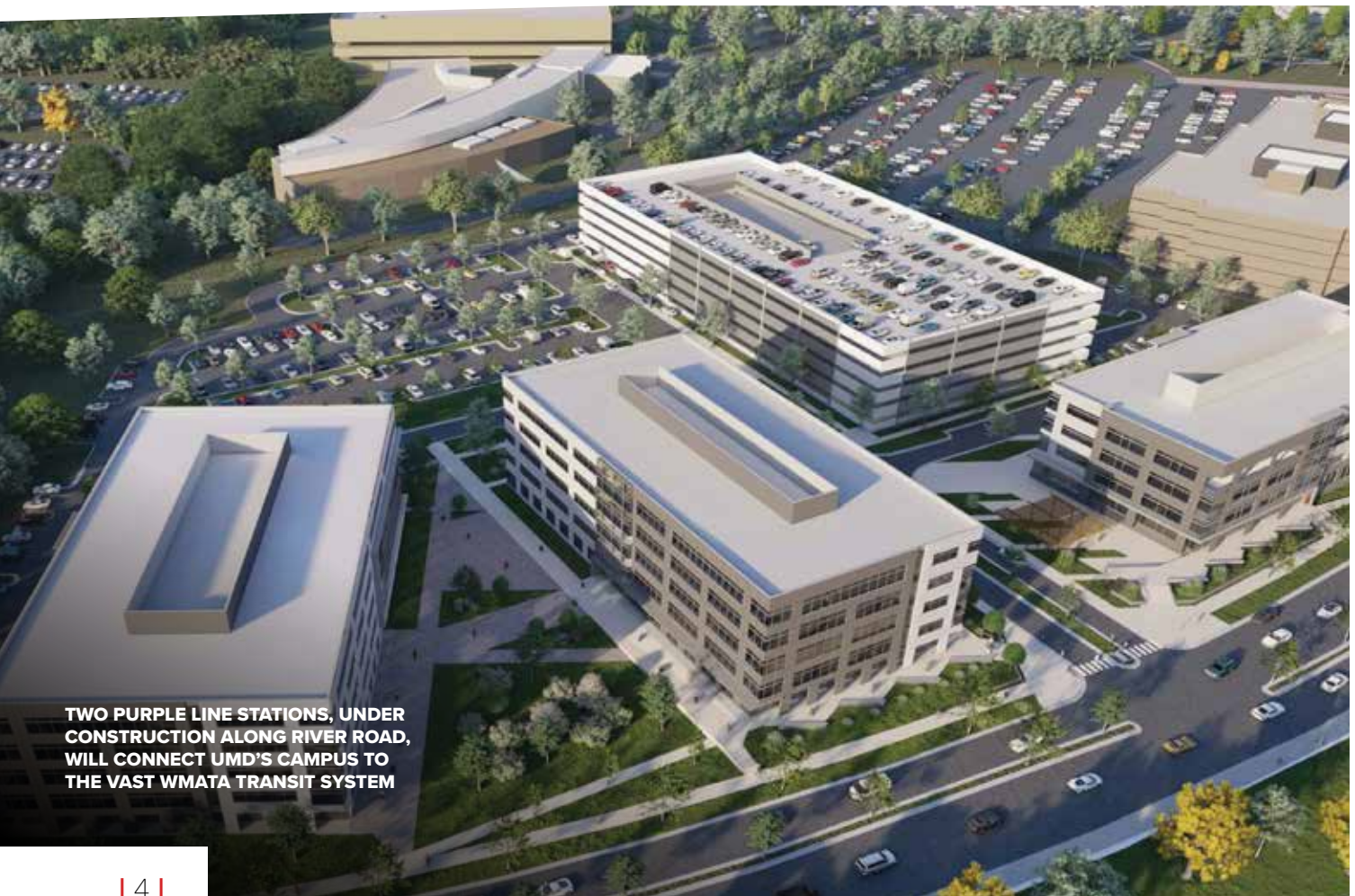
TWO PURPLE LINE STATIONS, UNDER CONSTRUCTION ALONG RIVER ROAD, WILL CONNECT UMD'S CAMPUS TO THE VAST WMATA TRANSIT SYSTEM

Walk to WMATA Green Line Metro, MARC, and two future MTA Purple Line Light Rail stations. Shuttle buses and the bike share program are a quick mode of transportation for getting around town.